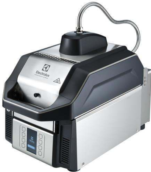
603877 (HSG3RPRSE1) SpeedDelight with flexible top plate, removable ribbed teflon plate (5kW) 230V